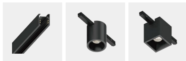
LX26-SM LX26-RS80-SL LX26-SS80-SL