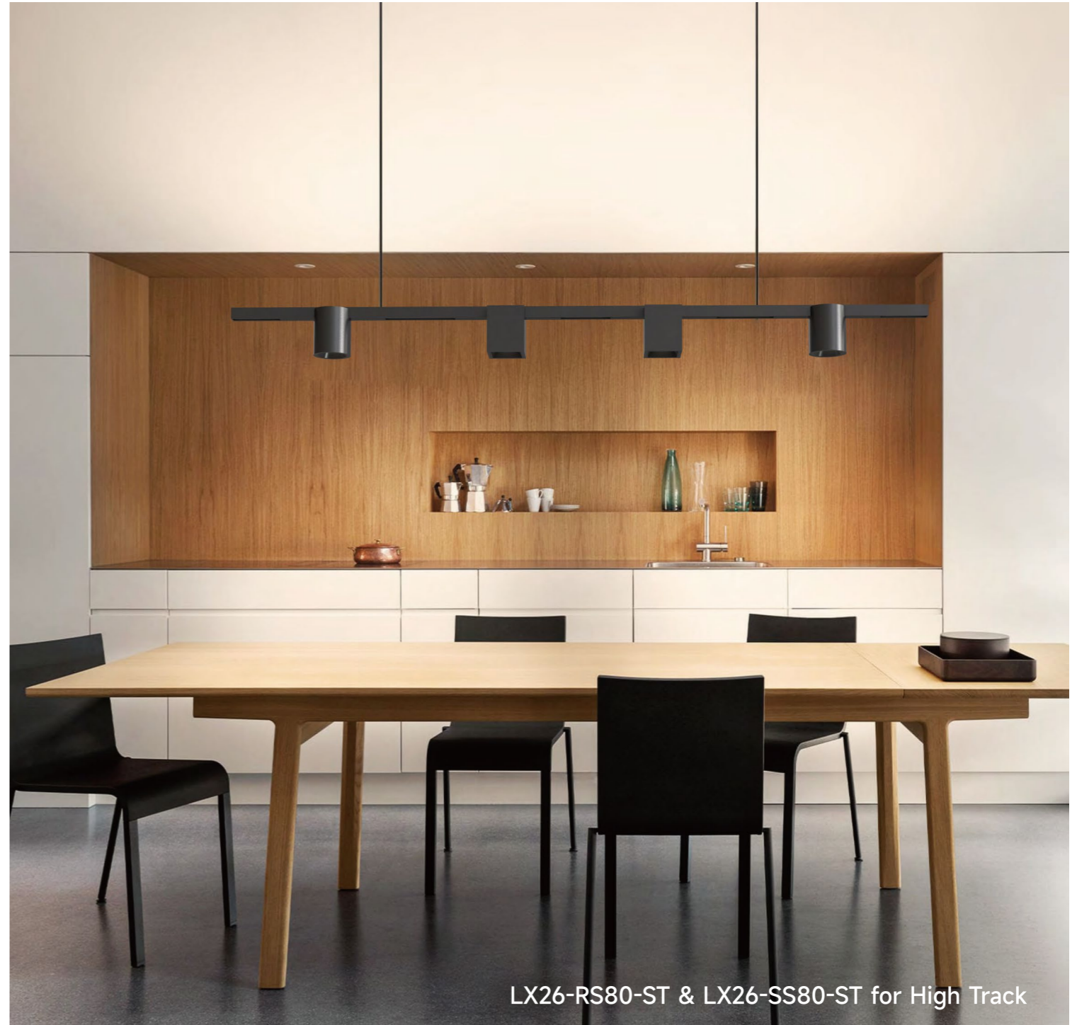
LX26-RS80-ST & LX26-SS80-ST for High Track