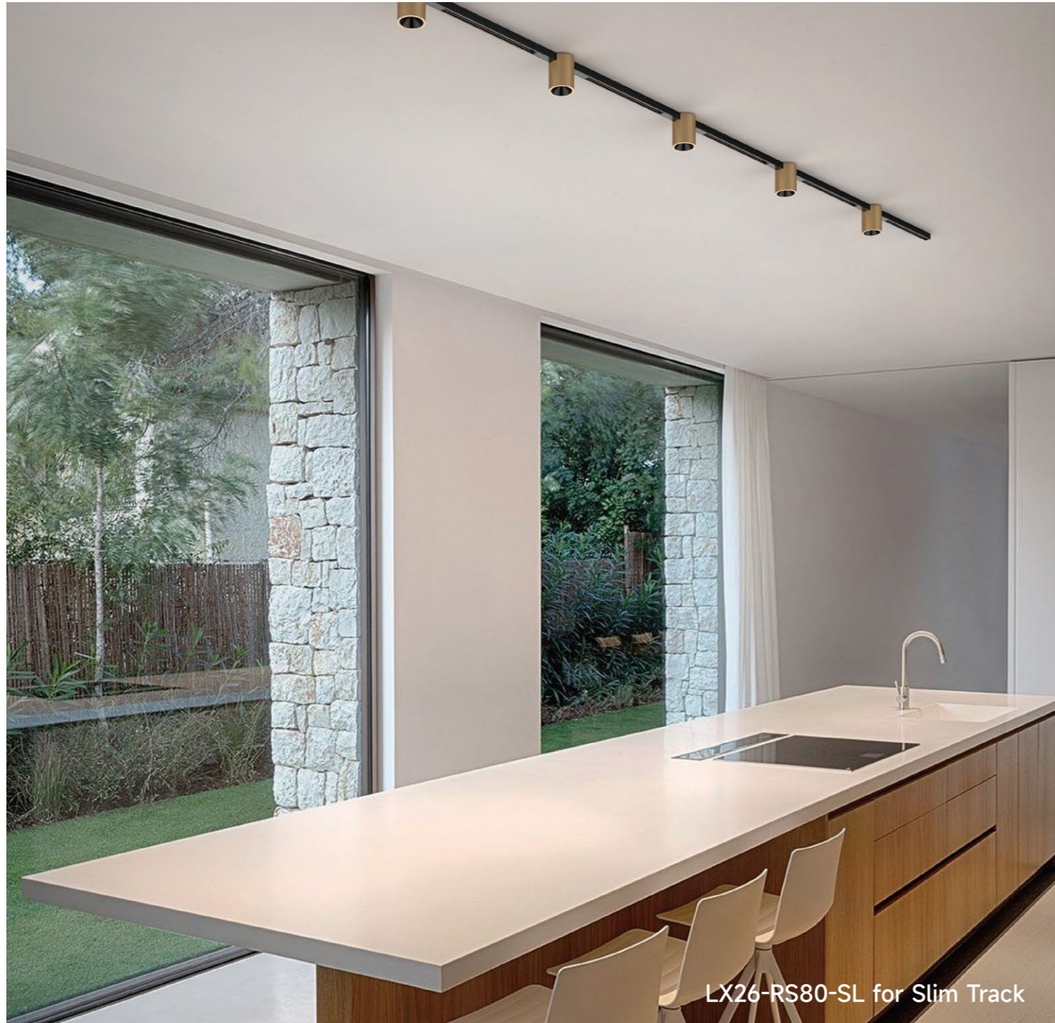
LX26-RS80-SL for Slim Track