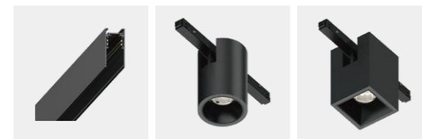
LX26-SUS LX26-RS80-ST LX26-SS80-ST