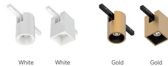
White White Gold Gold